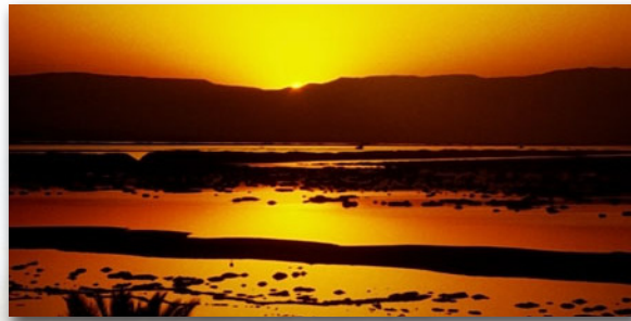
The Sea of Galilee

Our Lord spent almost 30 years of His earthly life in the Galilee region and we plan to spend our day in this region tracing His footsteps, beginning at the city of Capernaum, the headquarters for the ministry of Jesus Christ. We'll visit Caesarea Philippi in the area where the transfiguration took place. Traveling through the Golan Heights we'll understand better the discussion going on between the Syrians and the Israelis. We'll have lunch on the Sea of Galilee; the menu will include St. Peter's