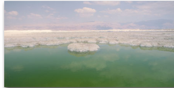
Salt Deposits on the Dead Sea

As we make our way through the Judean Desert to the Dead Sea, we'll stop at Qumran, the location of the discovery of the Dead Sea Scrolls. We will take a quick hike up to the waterfalls of En Gedi, where David hid from King Saul. A highlight of our trip will include a visit to Masada. The history of this magnificent fortress is moving. Make sure you bring your bathing suit because just before returning to Jerusalem we'll take an opportunity to try and swim in the Dead Sea.