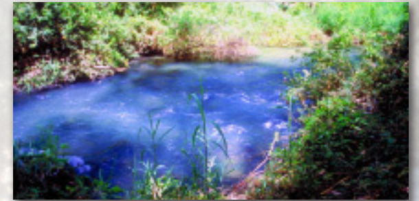
The Jordan River

Our trip will take us, today, to Mt. Nebo where God allowed Moses to view the Promised Land. It was somewhere in this area that Moses died, and Joshua took charge of the Israelites. We will see the location where the children of Israel crossed over into the Promised Land and where Elijah was caught up in a chariot of fire into heaven. Then we will visit the site on the Jordan River where Jesus was baptized by John the Baptist.