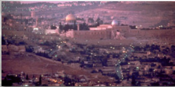
The Old City of Jerusalem

We will meet you and board our large air-conditioned bus to make a heartwarming trip up to Jerusalem. We will visit the shepherds fields, the Biblical location of the birth of Jesus, then we will make our way to the promenade for a magnificent panoramic view of both the Old City of Jerusalem and the New City. We will overnight in the first of the deluxe hotels.