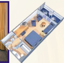
Superior Oceanview (199 sq.ft. balcony 41 sq.ft.)