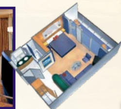
Grand Suite (390 sq.ft. balcony 116 sq.ft.)