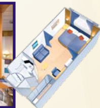
Oceanview Stateroom (160 sq.ft.)