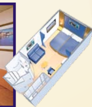
Standard Interior (150 sq.ft.)