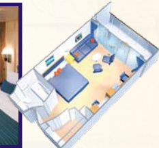
Junior Suite (297 sq.ft. balcony 64 sq.ft.)